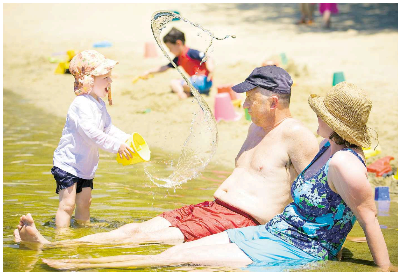
DINA RUDICK/GLOBE STAFF

* Expected high temperatures in Boston. Source: National Weather Service.